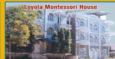
Loyola Montessori House