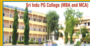
Sri Indu PG College (MBA and MCA)