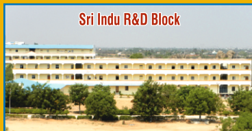
Sri Indu R&D Block