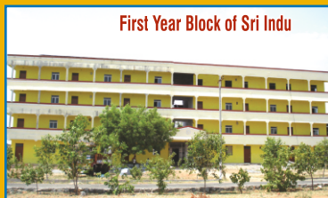
First Year Block of Sri Indu