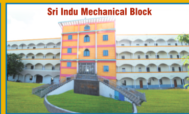
Sri Indu Mechanical Block