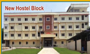
New Hostel Block