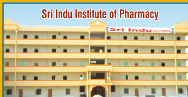
Sri Indu Institute of Pharmacy