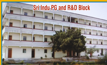
SriIndu-PG and R&D Block