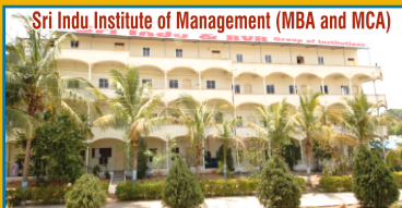
Sri Indu Institute of Management (MBA and MCA)