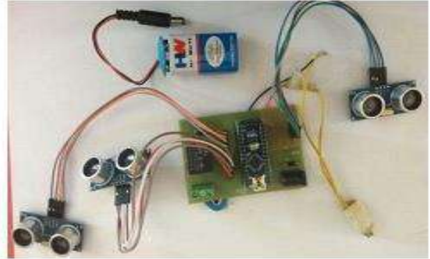
Real time vehicle tracking system