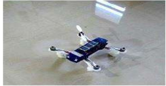
DIY Drone 2.0