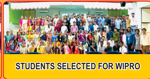
STUDENTS SELECTED FOR WIPRO