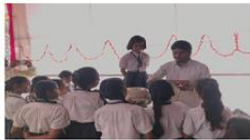
At PMRIT, Amaravathi.