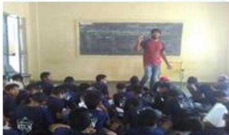
At Gurukul School, Mahabubnagar