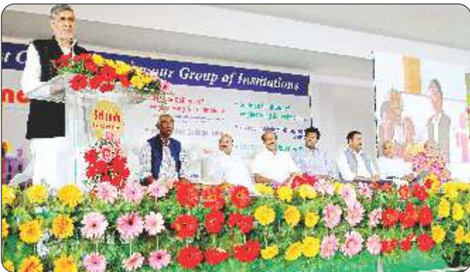
Interaction with Students for Child Friendly Telangana Shri Kailash Satyarthi Noble Laureate