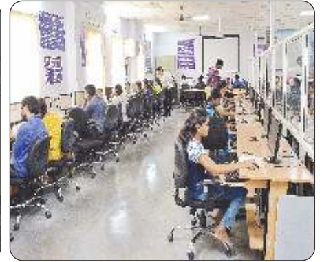
Students Writing Online Exam for Campus Drive.