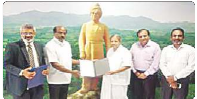
Swami Vivekananda Yoga Anusandhana Samsthana – World Wide MoU