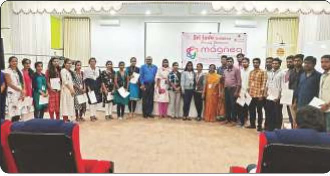
Magnea Software Recruitment Drive on 23-11-2019