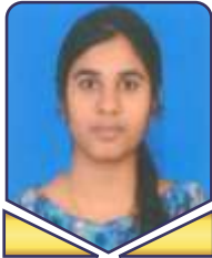
Talakanty Niha 17D41A04M0