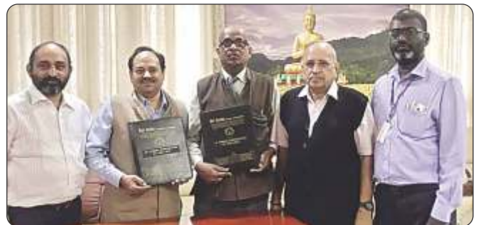
MOU with NATIONAL INSTITUTE OF AMATEUR RADIO (NIAR) .