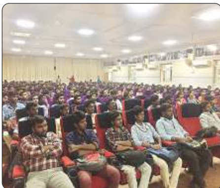
Modern Training Hall