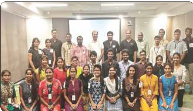
Selected students through ServiceNow