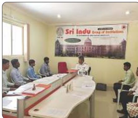
Group Discussion Room