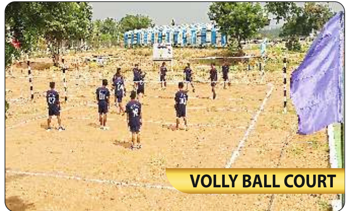
VOLLY BALL COURT