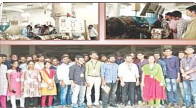
Maruthi Tubes PVT Ltd.