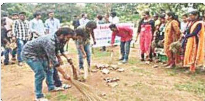
Swachh Bharat Activities