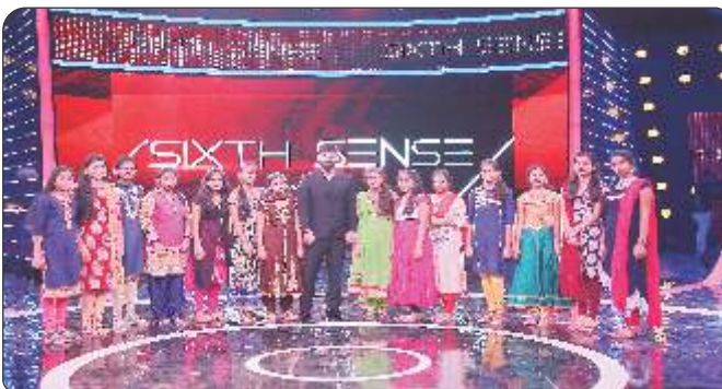
Sixth Sense, TV Show by Star Maa