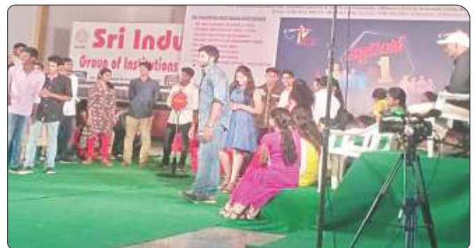
Students No. 1 Program by ETv Plus