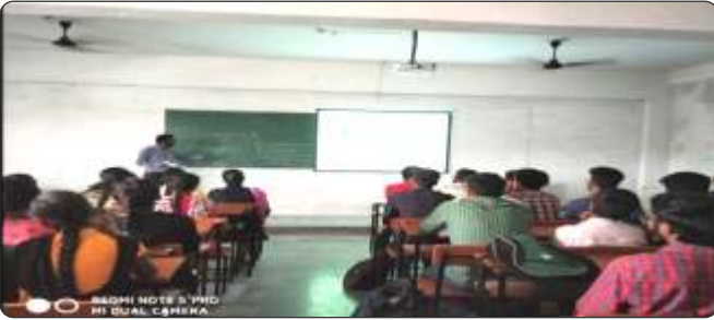
ICT Tools Based Class Rooms