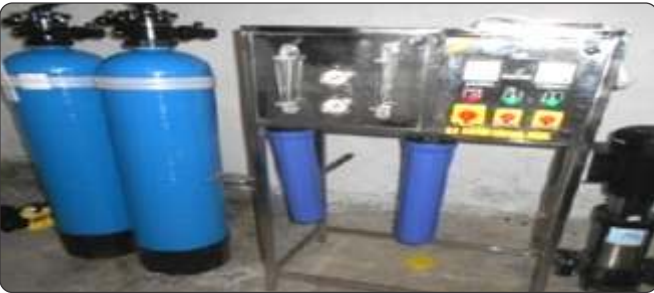
RO Water Plant