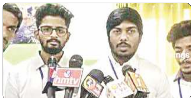
Our Entrepreneurs Interaction with Electronic Media