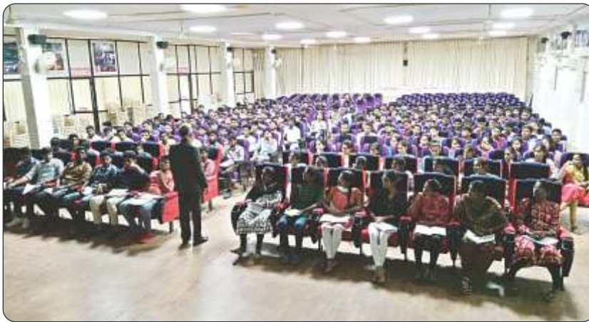
CRT Training Session

Campus Recruitment Training (CRT) is to aid candidates in their preparation for Recruitment through Campus or off campus. This Program is exclusively designed for the students to prepare for recruitment and is geared towards ensuring that the students are well equipped to get through the recruitment process of various IT and NON-IT companies. Daily training sessions for the students by the CRT and regular practice on Soft Skills, Quantitative Aptitude, & Mock Interviews, Group Discussions, Logical & Analytical Reasoning, Personality Development Skills, Spoken Communication Skills, Personal Interviews, Presentation skills and Resume Preparation. The program has different modules for preparing the job aspirant to tackle the interview process like: Written or online Test and Aptitude test, Company specific Comprehensive Tests, Guidance about the selection processes followed by various companies.