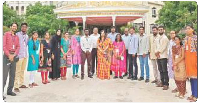
TASK Team with Sri Indu Students Ambassadors