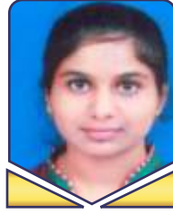
Malle Tejasvi 15X31A04A1