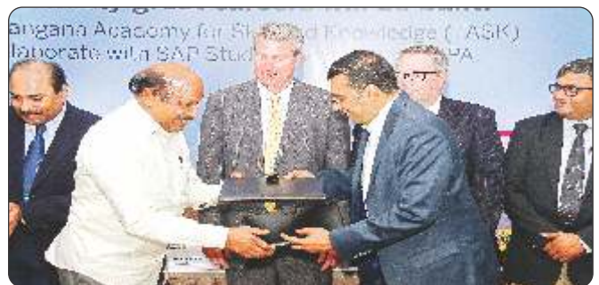
MOU with Student Academy Program (SAP)