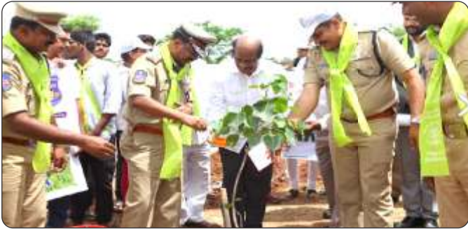
Haritha Haram at Sri Indu Campus