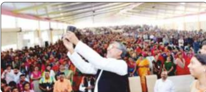
Shri Kailash Satyarthi Noble Laureate, visited Sri Indu Campus to Inaugurate Child Friendly Telangana programme.