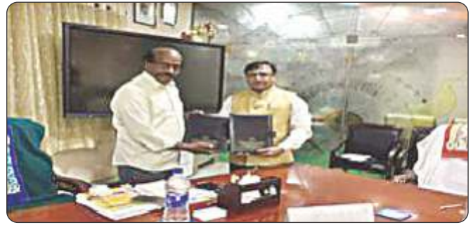
MoU with Swarnim Gujarat Sports University