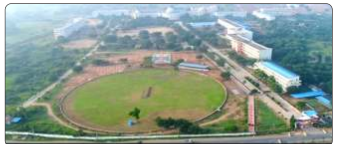
Campus Under CC TV Surveillance