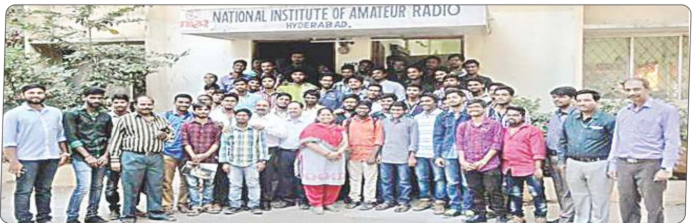
National Institute of Amateur Radio