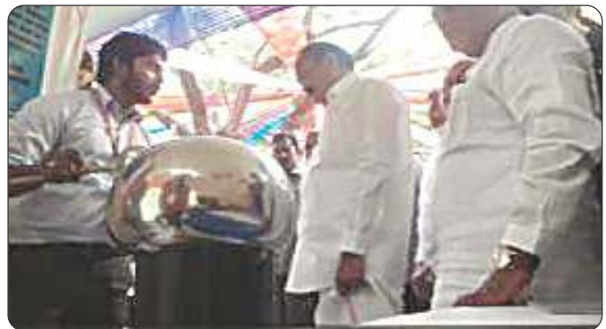
Students Explaining to Vice President of India Shri.M. Venkaiah Naidu.