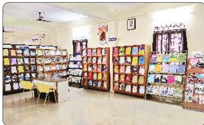
JOURNALS & MAGAZINES