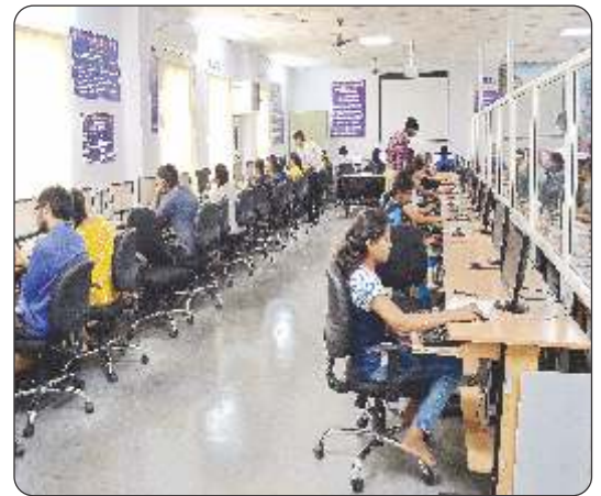
Students Practicing Online Exam