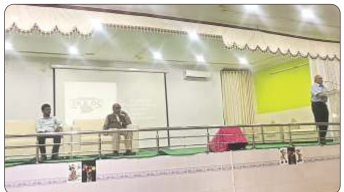
Students KART Design Challenge Season IV official Workshop organized by SOCIETY OF MECHANICAL AND AUTOMOTIVE ENGINEERS in Sri Indu Campus on 21 st & 22 nd December 2019.