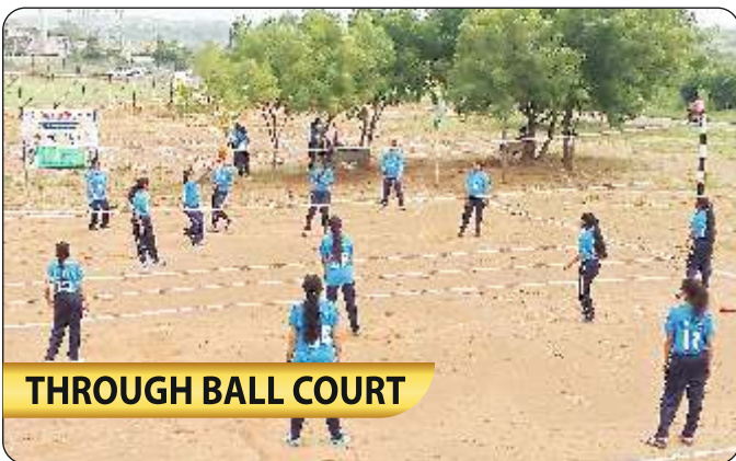
THROUGH BALL COURT