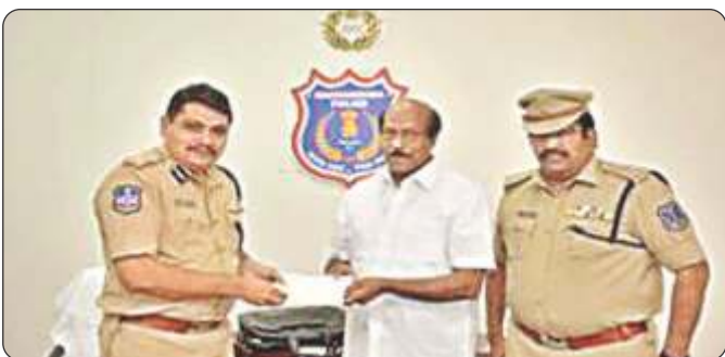
Funding of 5 Lakhs to Police Dept for CCTV Provision