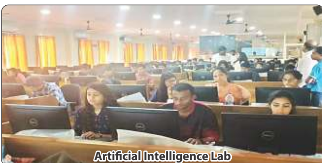
Artificial Intelligence Lab