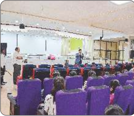
HR Interacting with Students