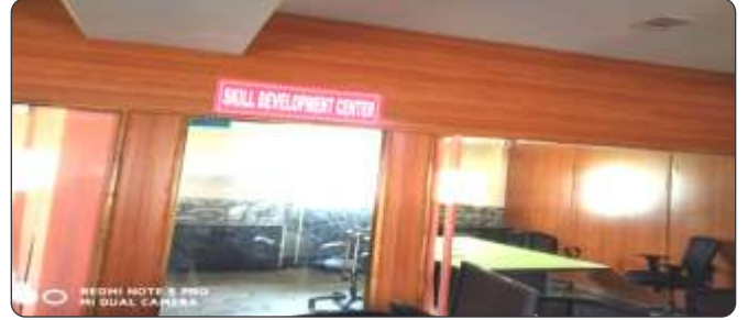
Skill Development Cell