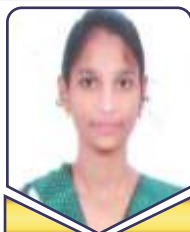
Malle Kavya 17D41A0165