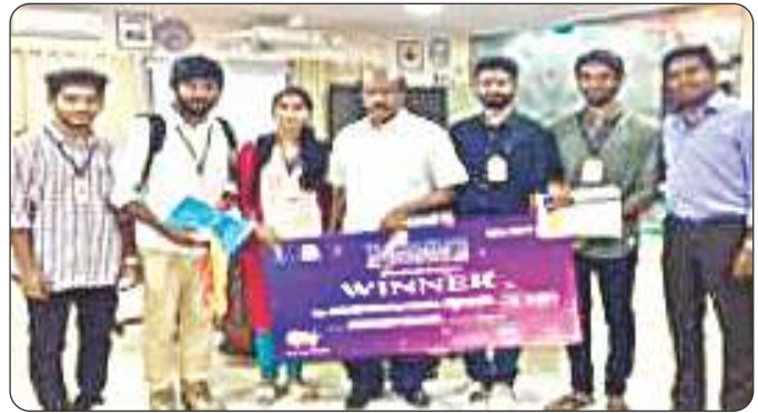
Secured second prize in the world robotics challenge at Technoxian, New Delhi.

Practisehub" is a Startup which provides wide range of opportunities for the students who are passionately interested in technical learning. Under this we have conducted many workshops in a wide range of landscapes like rural, urban, suburban which will be very useful for the young generation technical students. We theoretically and practically explain and help them in gaining knowledge. It is very important for the students of this generation.