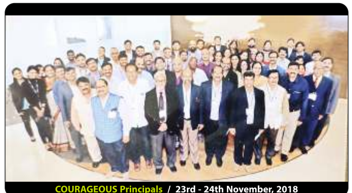
COURAGEOUS Principals / 23rd - 24th November, 2018

➤ 4 Students completed SWAYAM-NPTEL online course.