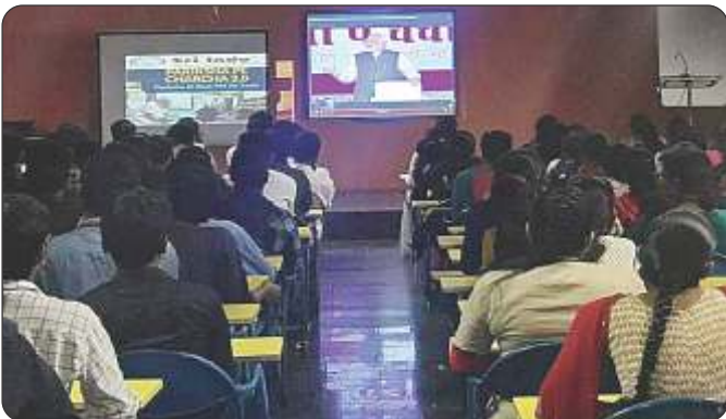
The Prime Minister, Shri Narendra Modi, interacted with students, teachers and parents, as part of Pariksha Pe Charcha