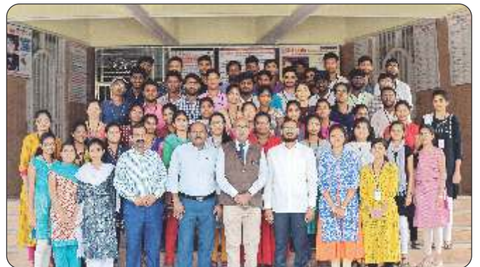
PYTHON WORKSHOP Conducted for 2017 batch students by TASK during 16 th – 20 th December 2019 @ Campus.