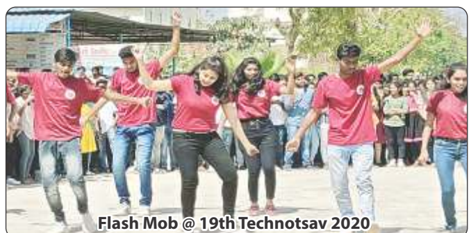
Flash Mob @ 19th Technotsav 2020