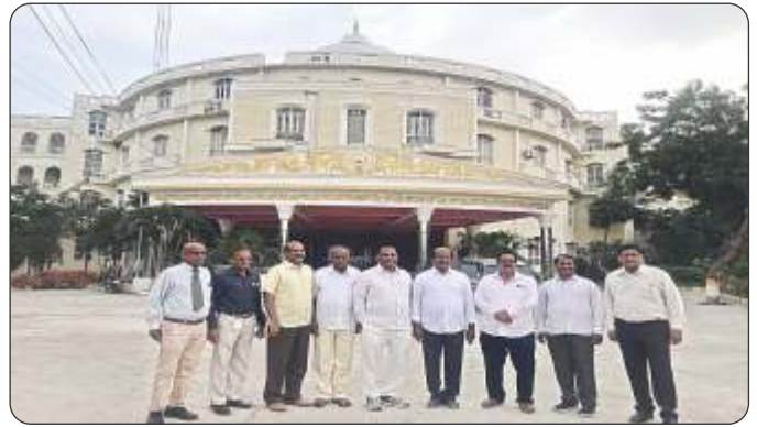
Visit of Indian Red Cross Society delegates to campus in the process of Blood Donation Camp in January 2020.