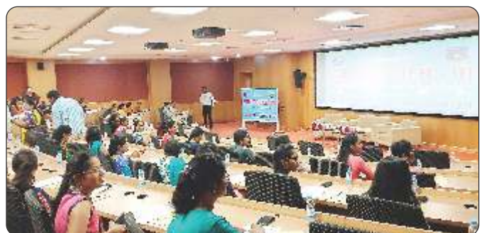
Students attended SHE FOR HER-III Programme by Rachakonda Police Commissionerate