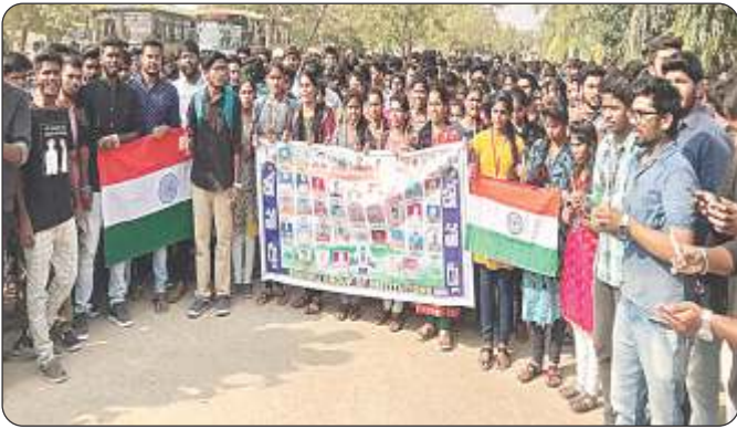
Sri Indu Group of Institutions Management, Staff & Students candle light marches to express solidarity with the families of the CRPF Jawans killed in Pulwama attack.