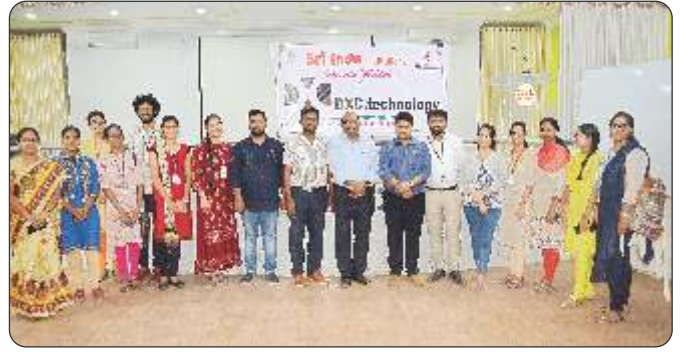
DXC.Technology Recruitment Drive on 24-11-2019