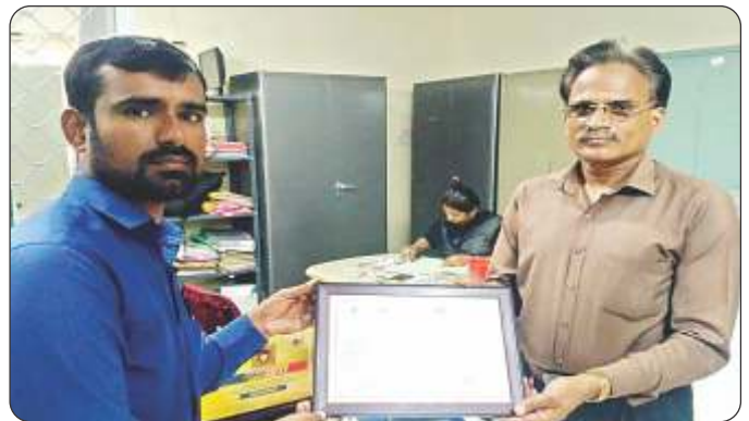
Appreciation certificate received for waste Management From ITC Group