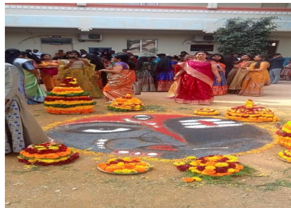
Students and Faculty celebrating Bathukamma Festival