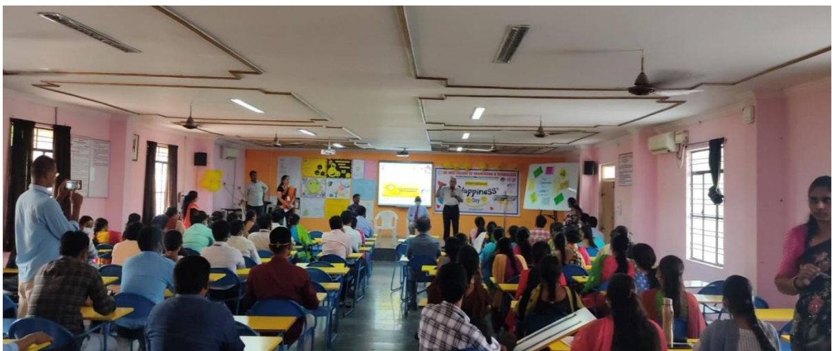
World Happiness Day