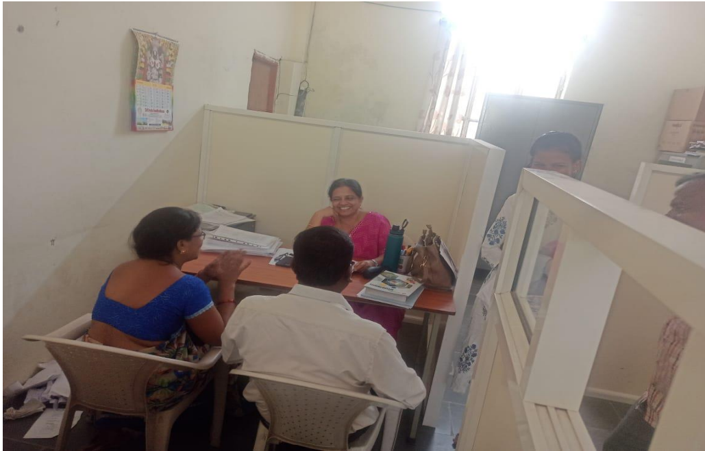
Head of the Department interacting with the parents of mentees