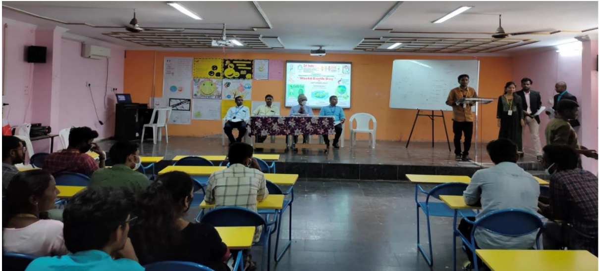
World Earth Day