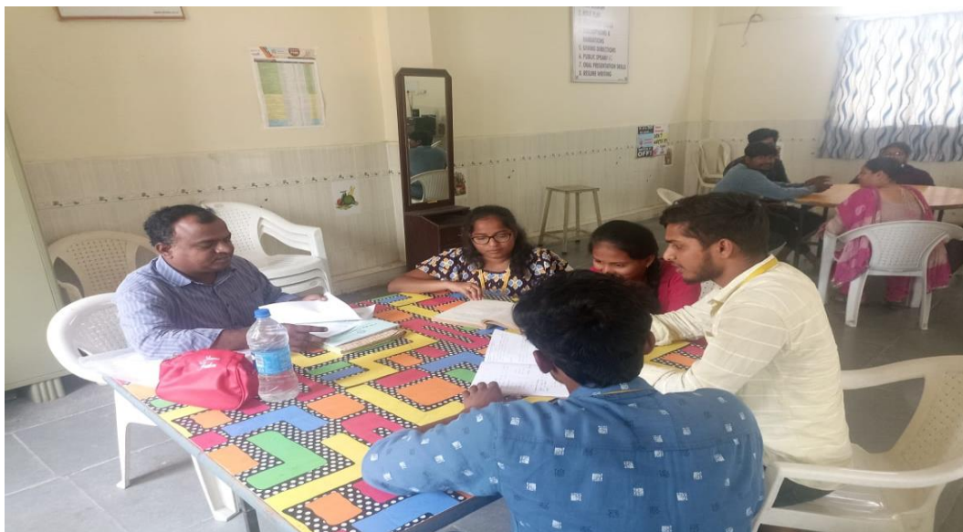
Faculty interacting with his mentees

The Department organized a mentor-mentee meeting drive on 22 nd February 2023 in order to strengthen the initiative. All faculty interacted with their mentees assigned. Parents of a few mentees were also visited the department on the day.