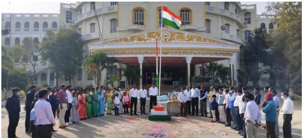
Republic Day 2023