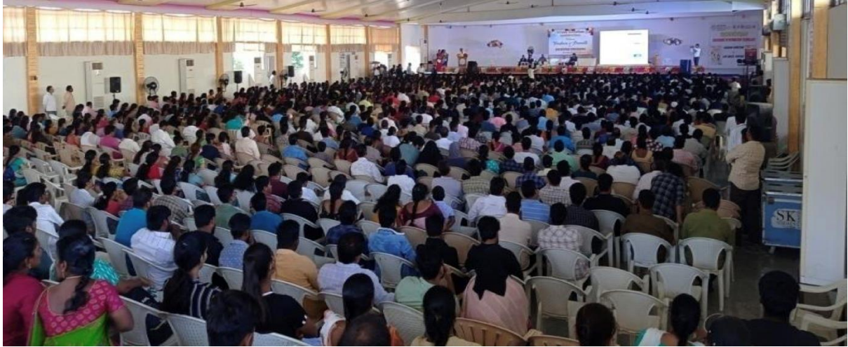
Parents and First year students attending the Orientation Programme