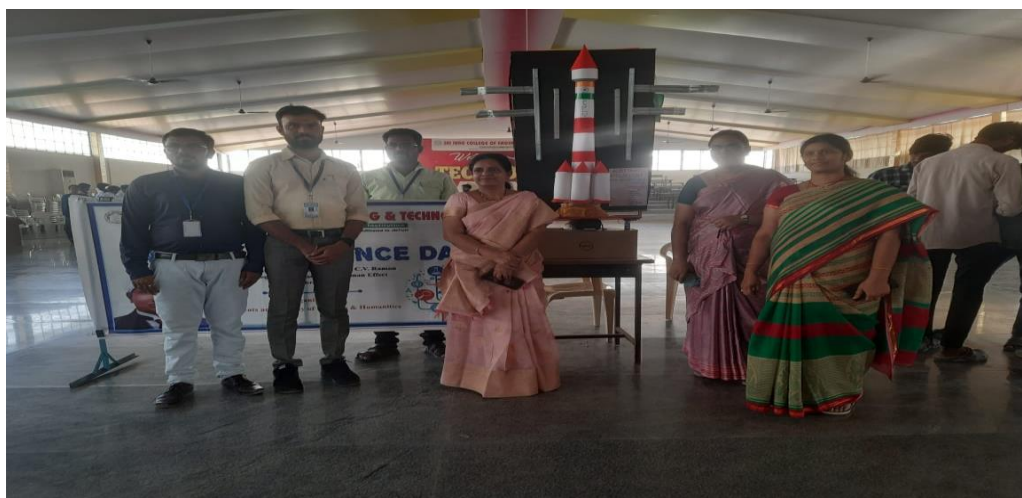
Head of the Department visiting the department students' Expo at Technotsav 2022