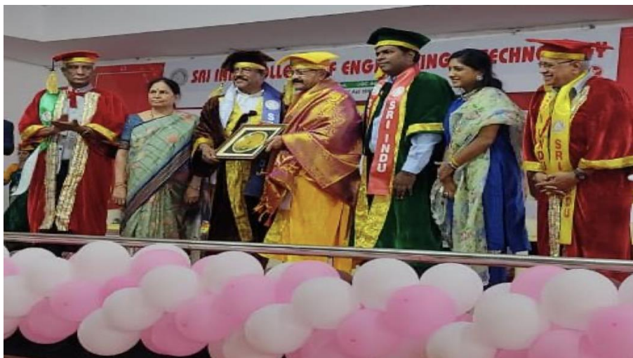
College authority honors the Vice Chancellor