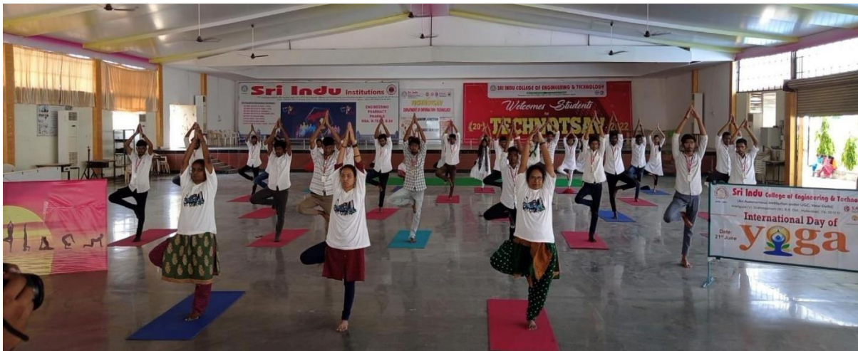
Department faculty and students at the training session on the International Yoga Day on 21 st June 2022

The Department organized a training session on the International Yoga Day. The session covered the basic knowledge and practices of Yoga. Dr. G Suresh, Principal of the college inaugurated the session. As many as sixty students from the department attended.