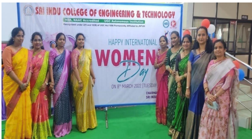
Faculty and students at photo session on the International Women's Day