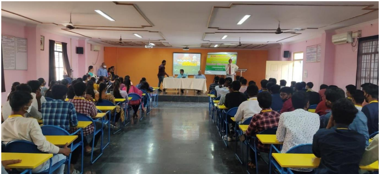
Mathrubhasha Diwas-Mother Language Day