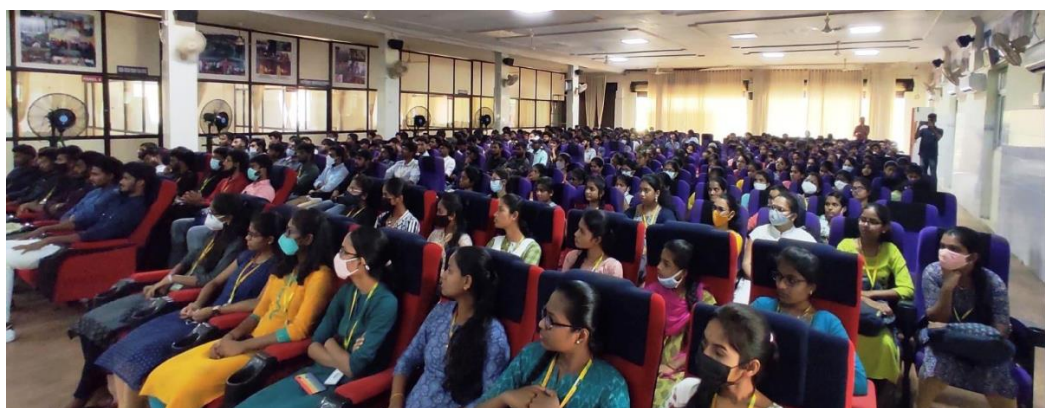
Department students listening to the lecture.