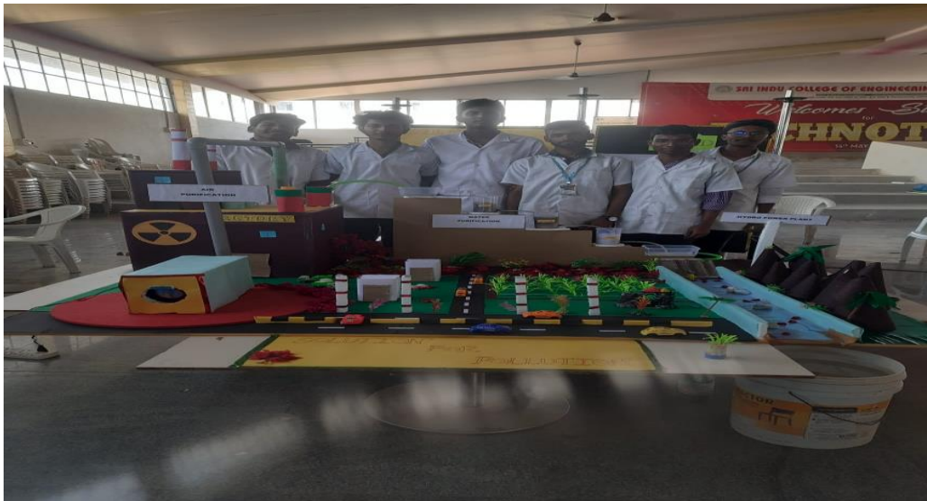
Department students with their demonstration

Every year department is conducting “TECHNOSTAV” program. It is the Technical Fest where entire college students (all four years) shall be participating in various Technical and other innovative events. In this fest students prepared the stalls to demonstrate their own developed modules, some funny events like gaming, competition-based events also conducted. Non-technical events like “flashmob “dance, Musical chairs, Circle also find place in the Utsav of Technologies.