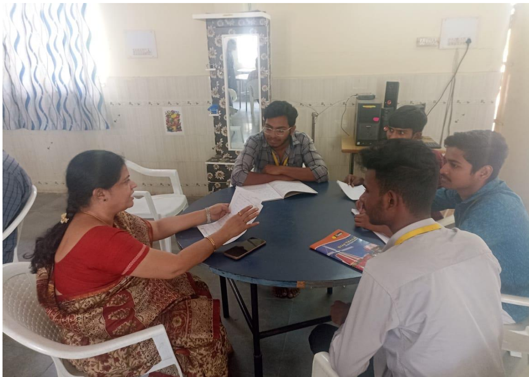
Head of the Department evaluates the activities of Mentor-mentee initiative