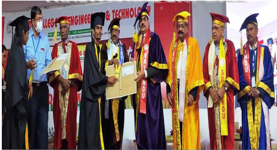
Candidates receiving Graduation Certificate