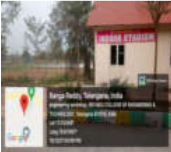
Table Tennis, Chess, Caroms, Gymnasium, Shuttle