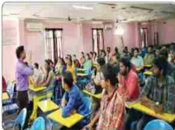
Lecture on soft skill development by Faculty member