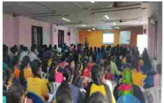
Students attended for the Programme